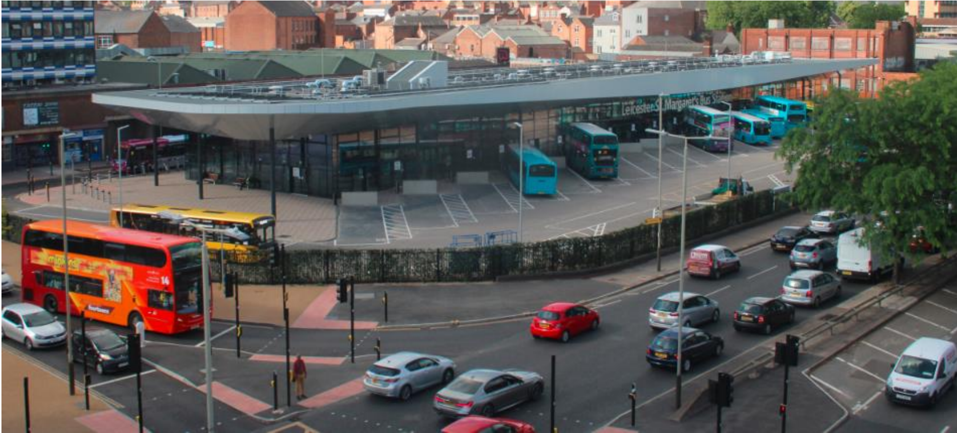
New St Margarets Bus Station