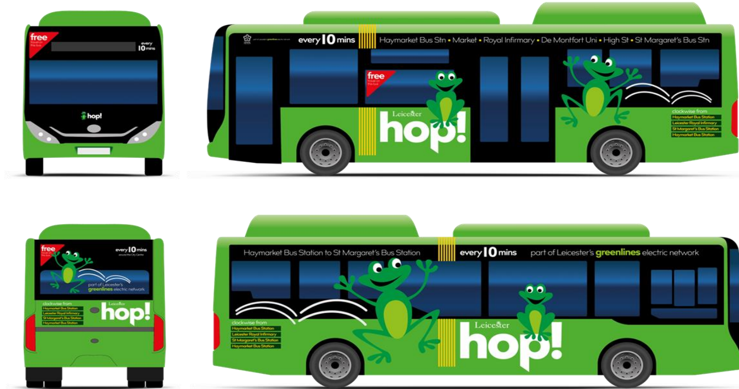
One branding option for new Hop! electric Greenline service