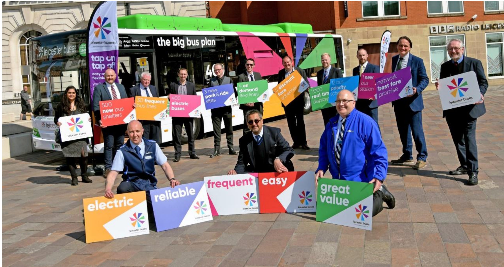
Picture of Partnership launch event showing branded bus and boards with aims and main deliverables