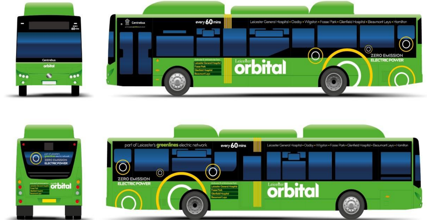
Example of branded Greenline Orbital electric bus

Greenlines Hop electric bus launch Mar 23